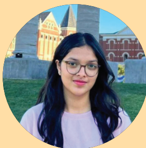
Pari Computer Science